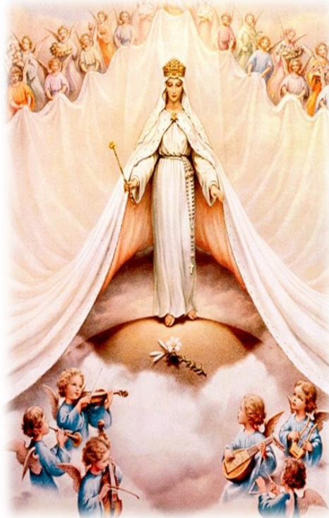
Mary, Queen of Angels, Pray for Us!