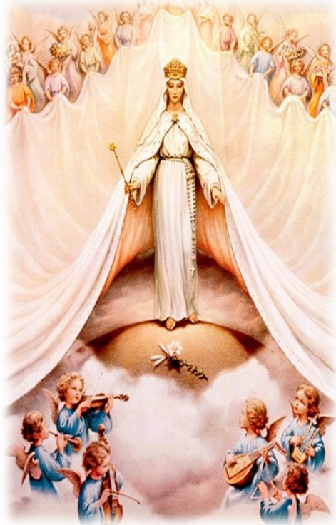
Mary, Queen of Angels, Pray for Us!