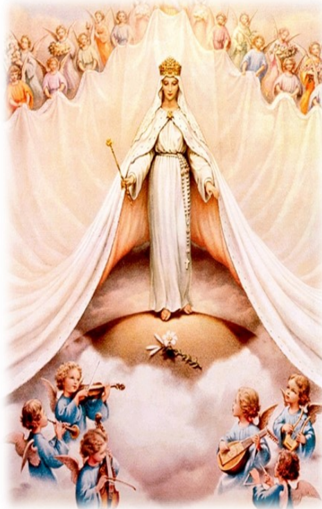
Mary, Queen of Angels, Pray for Us!