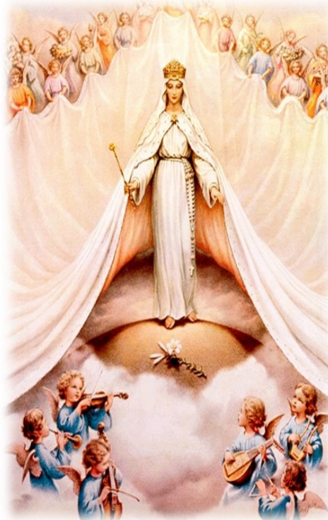
Mary, Queen of Angels, Pray for Us!