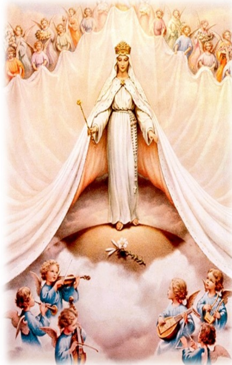
Mary, Queen of Angels, Pray for Us!