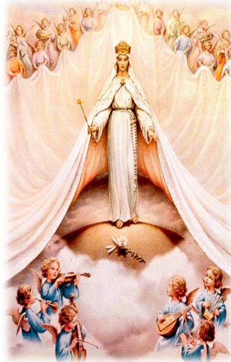
Mary, Queen of Angels, Pray for Us!