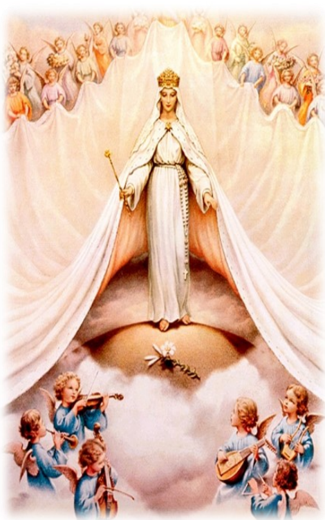
Mary, Queen of Angels, Pray for Us!

<u>First Friday Devotions to the</u> <u>Sacred Heart of Jesus</u> Exposition/Confession: 10:00 am, Mass 11:30 am