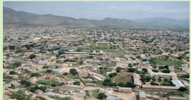
City of Keran

Thank you for your prayers and generosity. God Bless You.