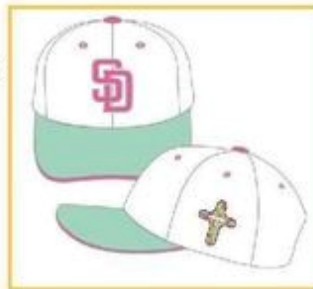
CATHOLIC NIGHT HAT

This event is approved by the Bishop and its purpose is to strengthen and encourage Catholic laity in their role as witnesses in the public square.