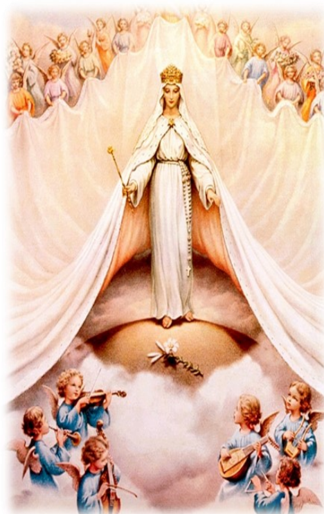
Mary, Queen of Angels, Pray for Us!