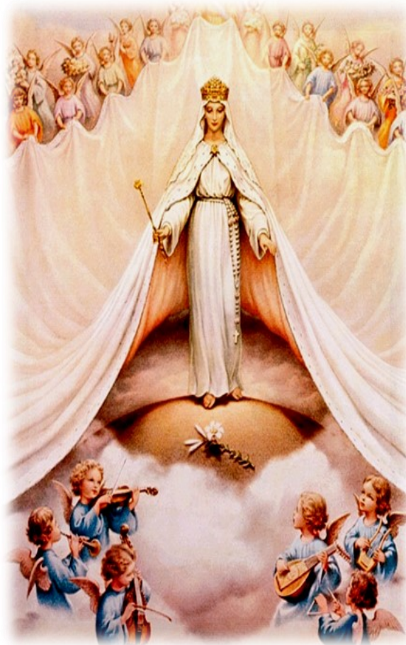
Mary, Queen of Angels, pray for us!