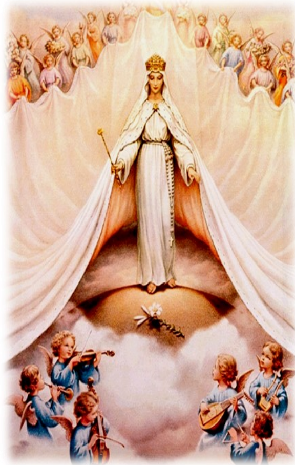
Mary, Queen of Angels, pray for us!