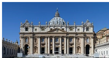
The main façade and dome of Saint Peter's Basilica, seen from St. Peter's Square

Basilicas are churches that are so titled because of their antiquity, dignity, historical importance, or significance as centers of worship. A cathedral is the principal church of a diocese, which contains the chair of the bishop, or "cathedra" in Latin. The chair is the symbol of the bishop's teaching authority.