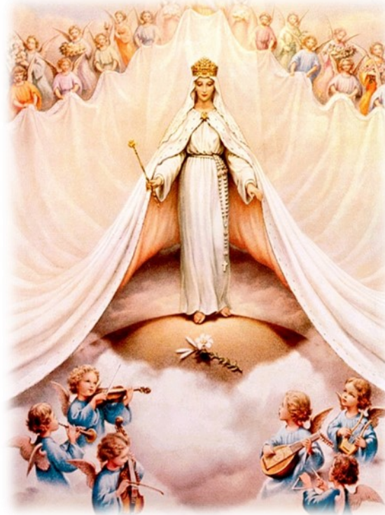
Mary, Queen of Angels, Pray for Us!

First Saturday to Honor the Immaculate Heart of Mary Mass 9:00 am