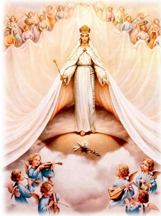
Mary, Queen of Angels, Pray for Us!

First Saturday to Honor the Immaculate Heart of Mary Mass 9:00 am