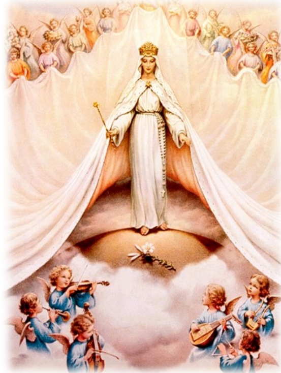
Mary, Queen of Angels, Pray for Us!

First Saturday to Honor the Immaculate Heart of Mary Mass 9:00 am