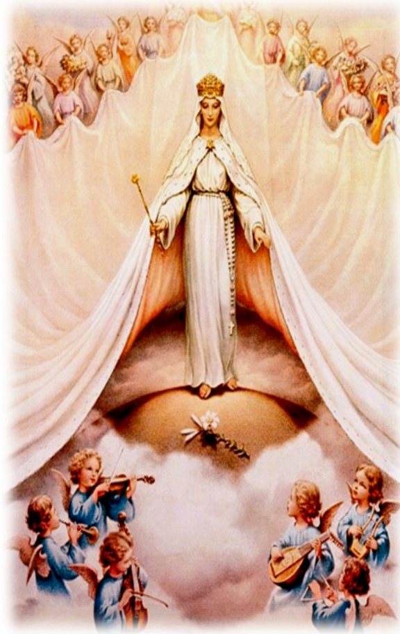
Mary, Queen of Angels, pray for us!