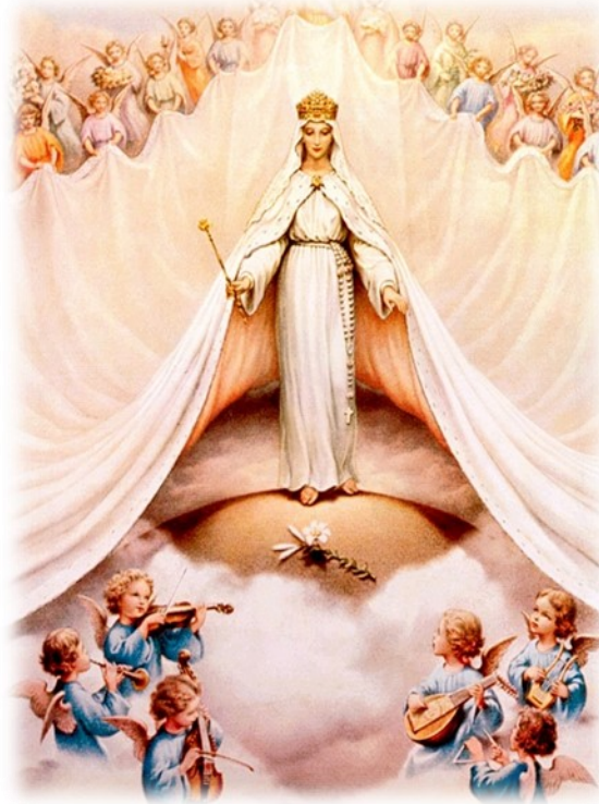
Mary, Queen of Angels, Pray for Us!

First Saturday to Honor the Immaculate Heart of Mary Mass 9:00 am