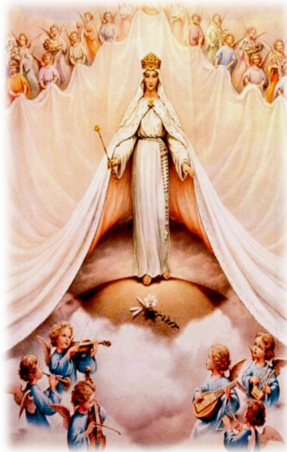
Mary, Queen of Angels, pray for us!