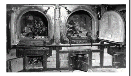
Remember . . . the NAZI's started with burning books. Human beings were next . . .