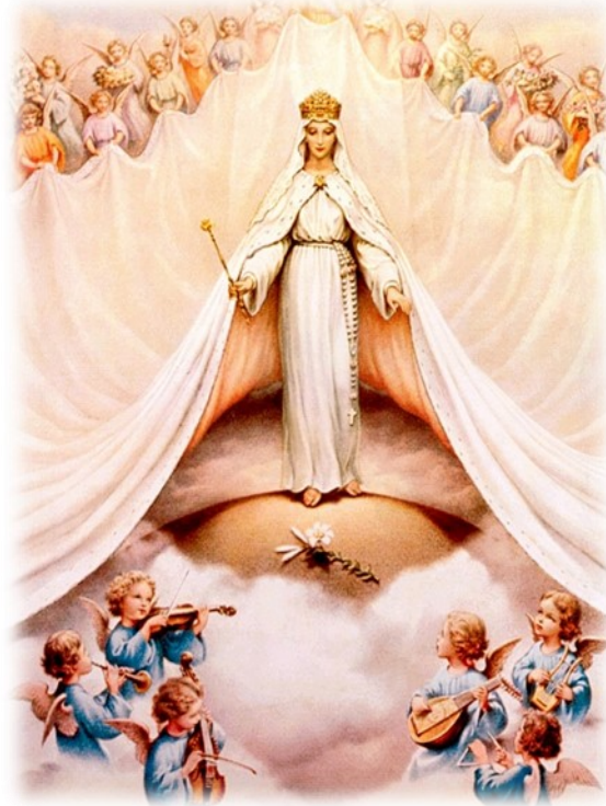
Mary, Queen of Angels, Pray for Us!

First Saturday to Honor the Immaculate Heart of Mary Mass 9:00 am