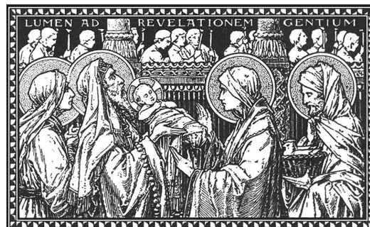
THE PRESENTATION OF THE LORD

WATCH YOUR THOUGHTS, FOR THEY BECOME WORDS. WATCH YOUR WORDS, FOR THEY BECOME ACTIONS. WATCH YOUR ACTIONS, FOR THEY BECOME HABITS. WATCH YOUR HABITS, FOR THEY BECOME CHARACTER. WATCH YOUR CHARACTER, FOR IT BECOMES YOUR DESTINY.