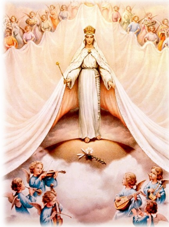
Mary, Queen of Angels, Pray for Us!

First Saturday to Honor the Immaculate Heart of Mary Mass 9:00 am