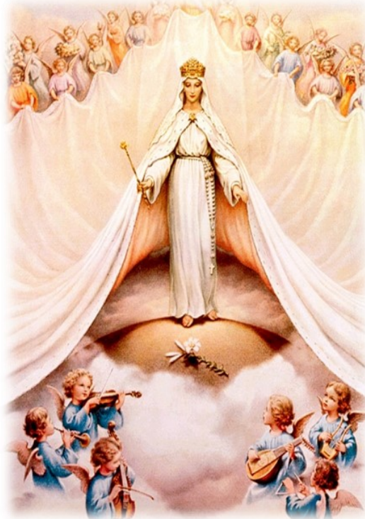
Mary, Queen of Angels, Pray for Us!