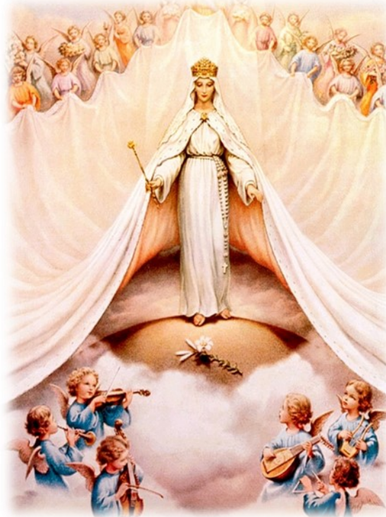
Mary, Queen of Angels, Pray for Us!

First Saturday to Honor the Immaculate Heart of Mary Mass 9:00 am